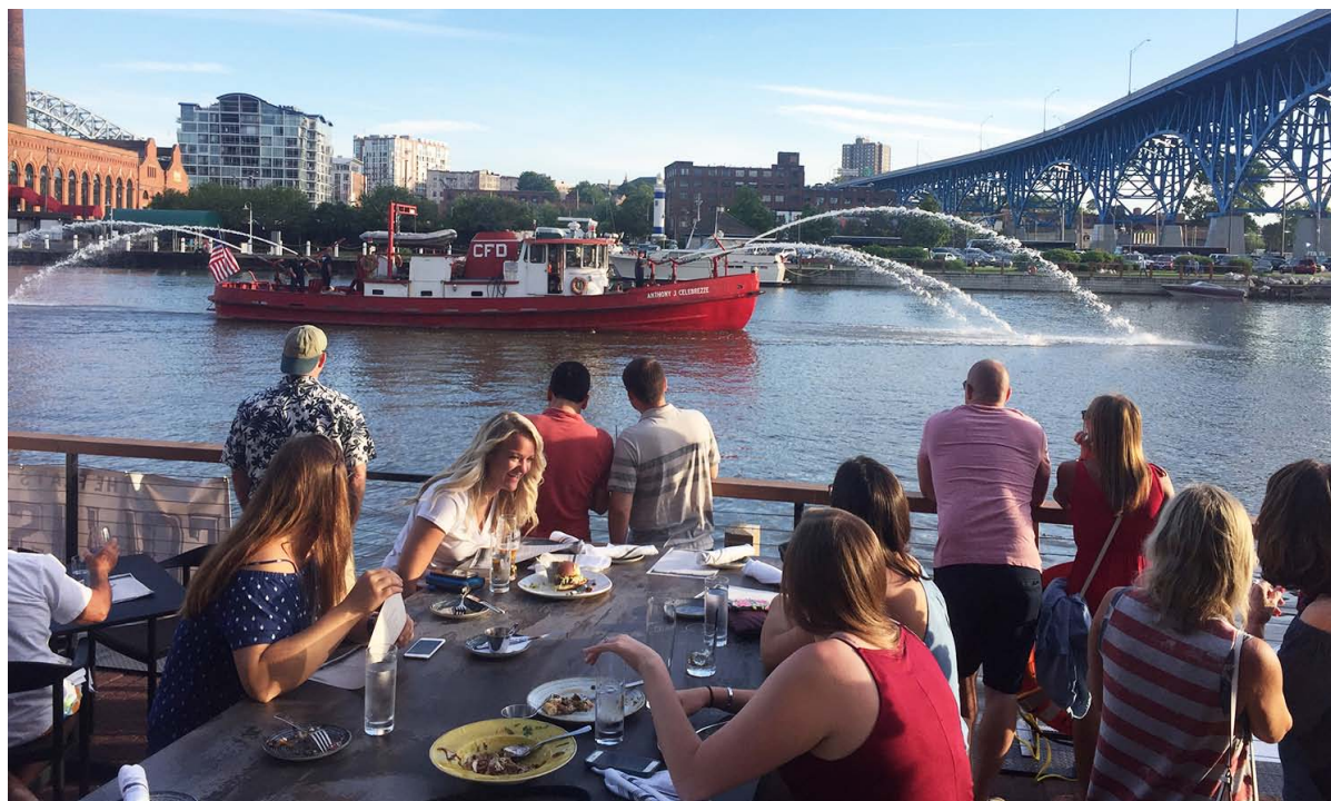
Having dinner at Flats East Bank while watching the fire boat.