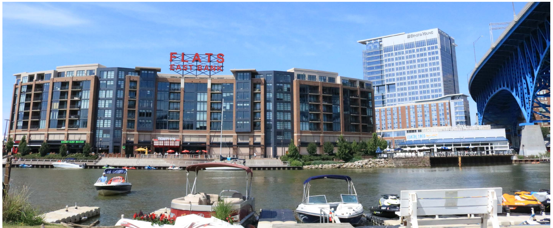
Flats East Bank development along the Cuyahoga River in Cleveland, Ohio.

However, what was once a civic embarrassment would become a source of community pride. Between the 1970s and 1990s, the Flats underwent a dramatic transformation from a manufacturing and distribution center to