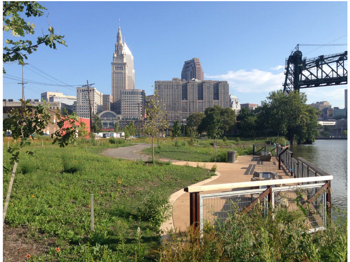
Improving fishing access to the Cuyahoga River.

macroinvertebrates are present in most reaches, and peregrine falcons, bald eagles, and osprey have returned to the banks. Even the industrial Flats now has resident blue and green heron, cormorants, and seasonal visits from migrating birds and waterfowl, evidence of increased fish populations. Benthic macroinvertebrate