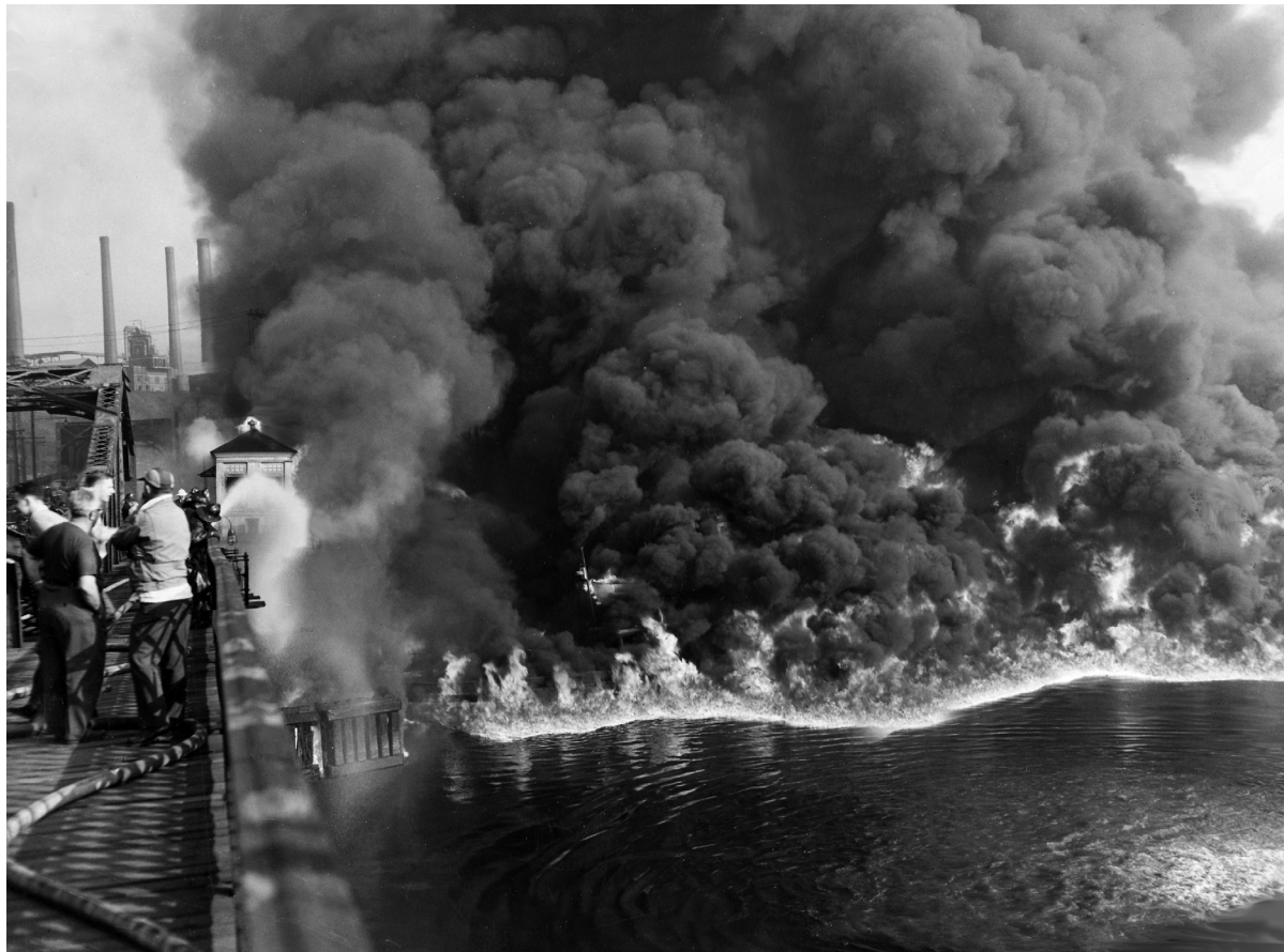
Cuyahoga River fire, November 3, 1952.

The goal of the RAP was to restore the river and all impaired beneficial uses through the remediation of existing problems, and to protect the resource for future generations. Beneficial use impairments included restrictions on fish consumption; degradation of fish populations; fish tumors or other deformities; degradation of benthos; restrictions on dredging activities; eutrophication or undesirable algae; beach closings (recreational contact) and public access and recreation; degradation of aesthetics; and loss of fish habitat. The initial Stage 1 RAP (i.e., identification of use impairments and