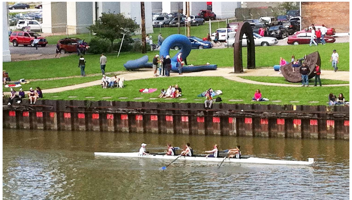
Rowing in navigational channel of the Cuyahoga River.

The lower six miles (nine kilometers) of the Cuyahoga River are designated a federal navigational channel, where water depths must be maintained at a minimum of 23 feet (seven meters) to allow the passage of 700-foot-long (213-meter-long) ships supplying the steel mill and other users. Upper portions of the Cuyahoga River contribute considerable amounts of sediment into the federal navigational channel,